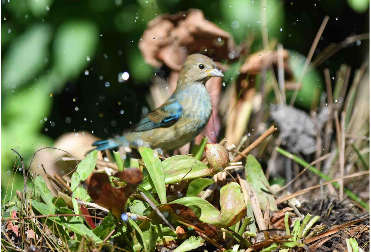
This fall Indigo Bunting male pales in comparison to loads of April spring males.