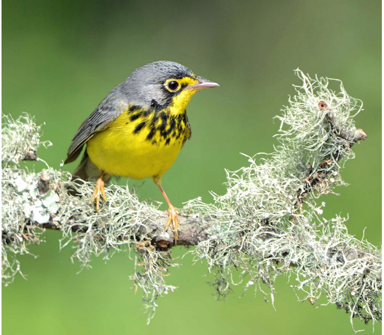
Moss or other decorations enhance the photography for birds like Canada Warbler.